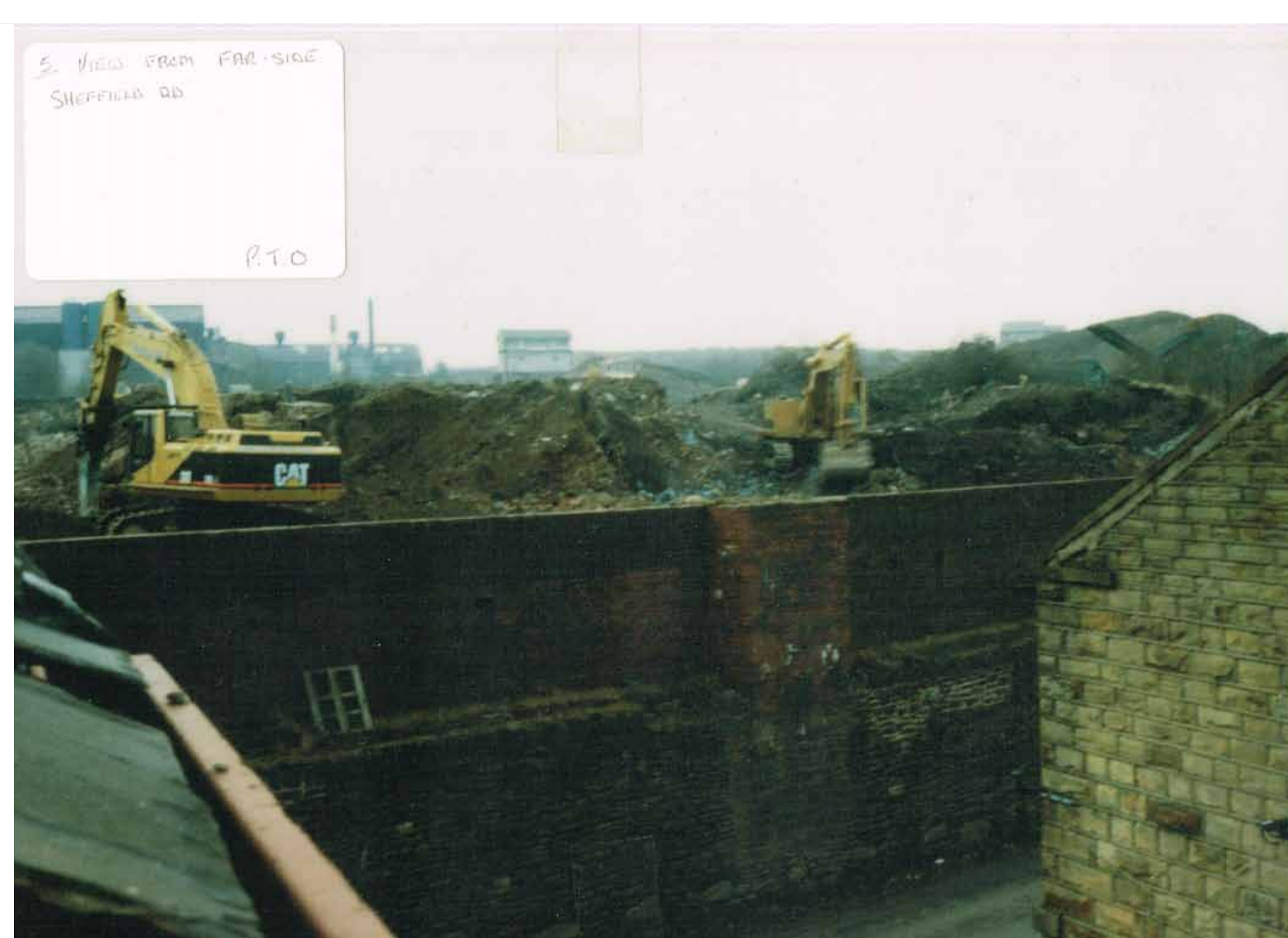
5. View from far side SHEFFIELD RD P.T.O