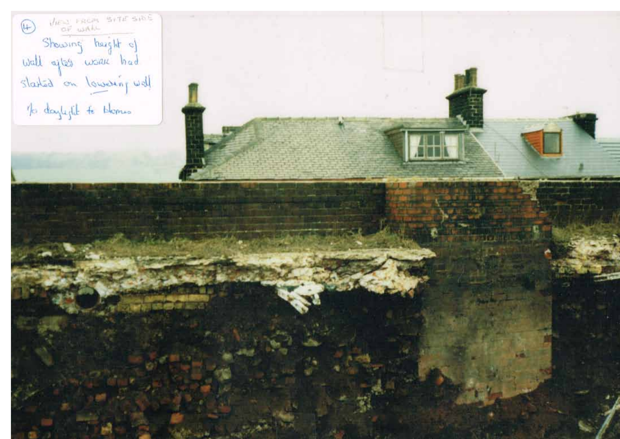
View from site side of wall Showing height of wall after work had started on lowering wall to daylight to blomas