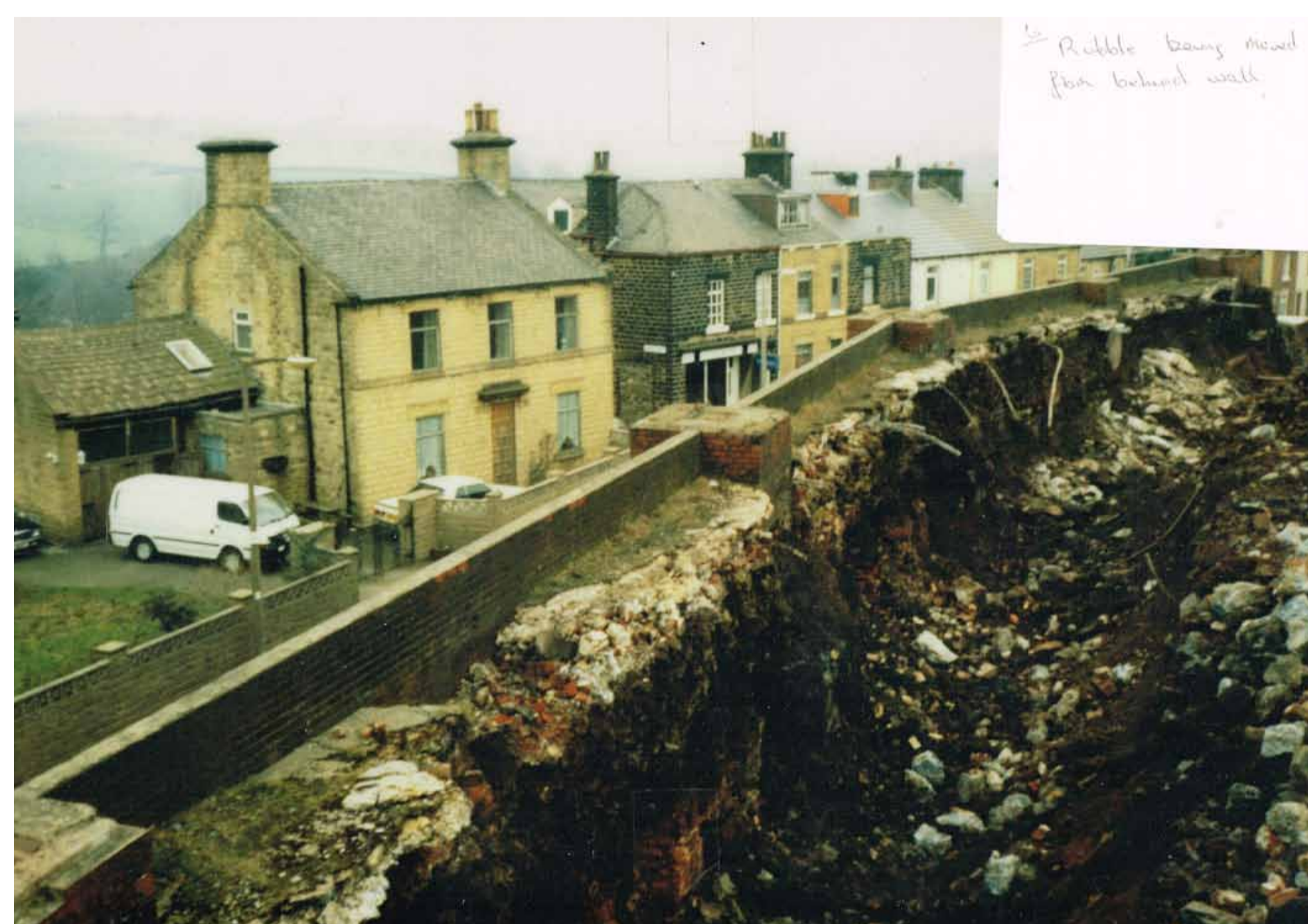
Rubble being moved from behind wall