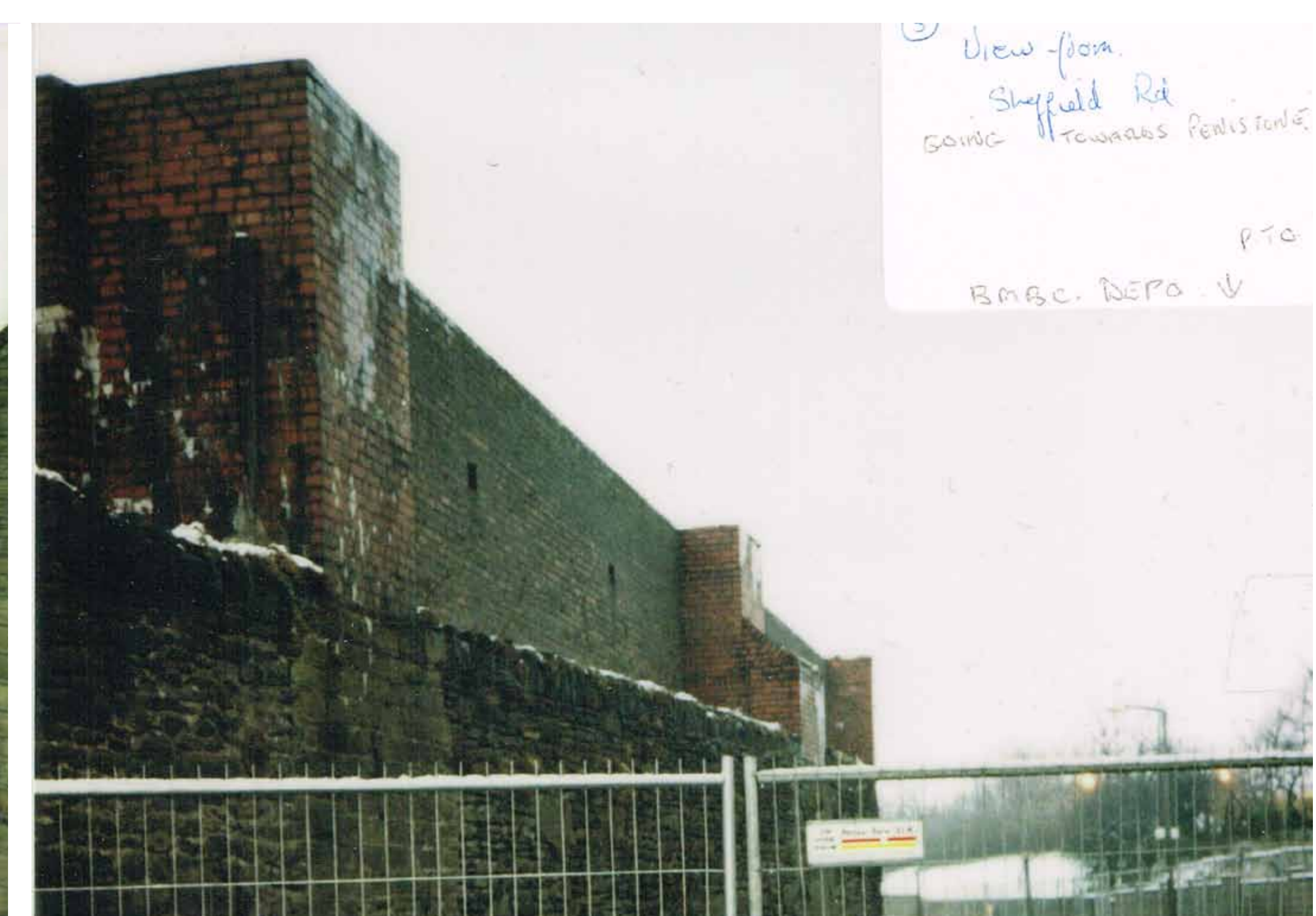
View from Sheffield Rd going towards Penistone P.T.O B.M.B.C. DEPO. V